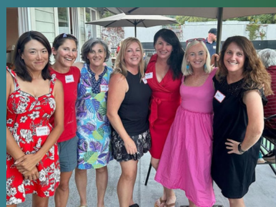
CTC NEWSLETTER AUGUST 2023